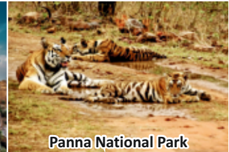
Panna National Park