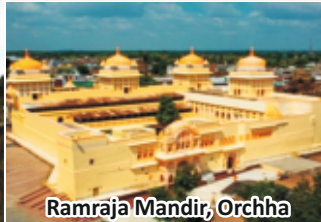
Ram Raja Mandir, Orchha